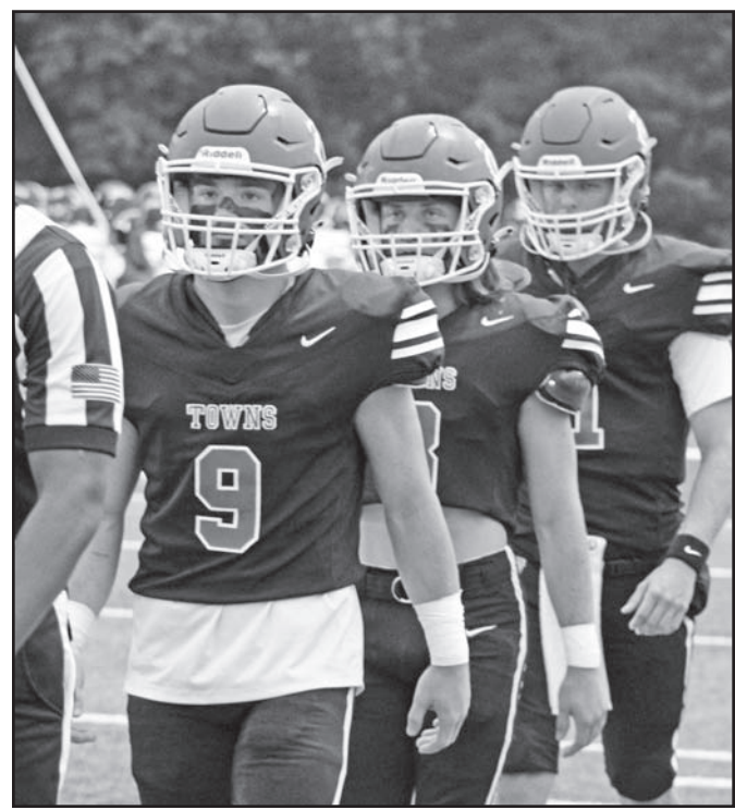
The Towns County captains take the field ahead of last Friday's game with Union County.