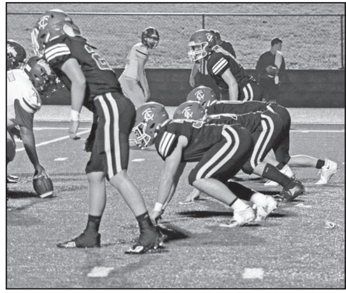
The Towns County defensive front during the second half against Union County.